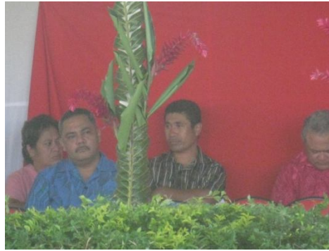
Member of the Health Sector