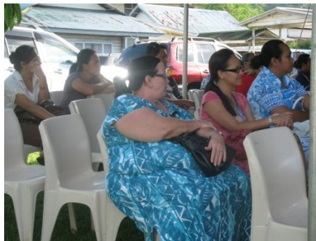
Representatives from the WHO & NHS