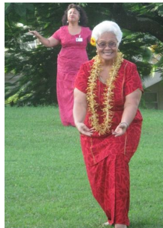
Old & New dancing the tauluga (Siva Samoa) – finale of the day