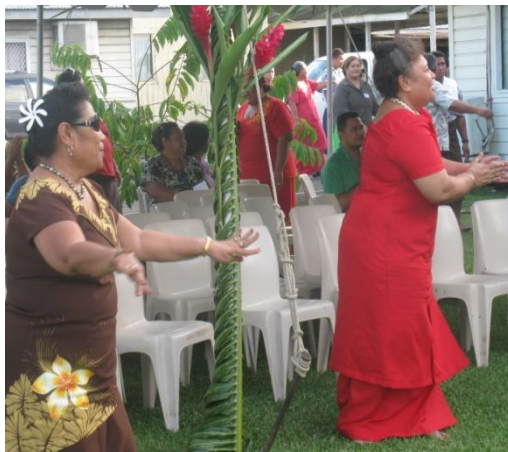
Siva Samoa (Traditional Samoan Dance)