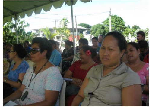
Staff of the Ministry of Health