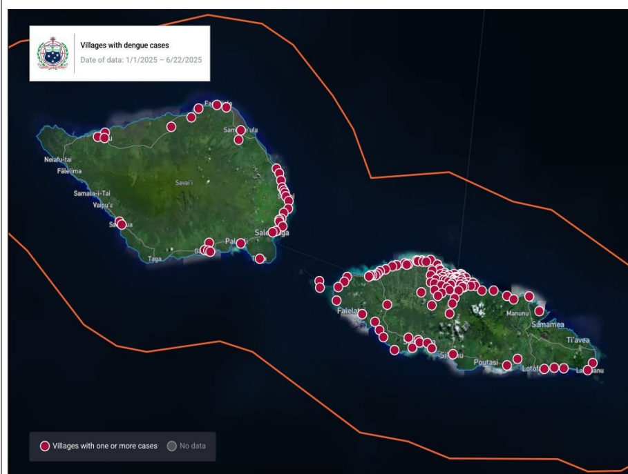
Figure 3. Map of lab-confirmed dengue cases by village, January 2025 to date

Notably, majority of dengue cases are distributed across the Apia Urban Area (AUA) and North West of Upolu (NWU) regions