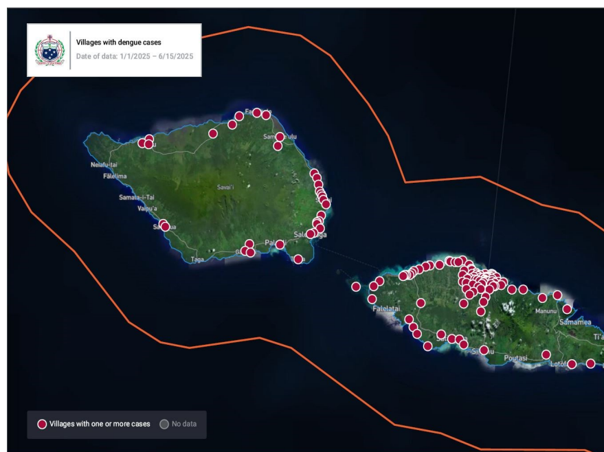
Figure 3. Map of lab-confirmed dengue cases by village, January 2025 to date

Since January 2025, there have been 397 dengue lab-confirmed cases, most of whom are below 20 years old (82%).